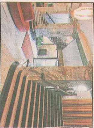
The Colcord Hotel's lobby reflects its heritage. The hotel is being bought for an undisclosed amount.