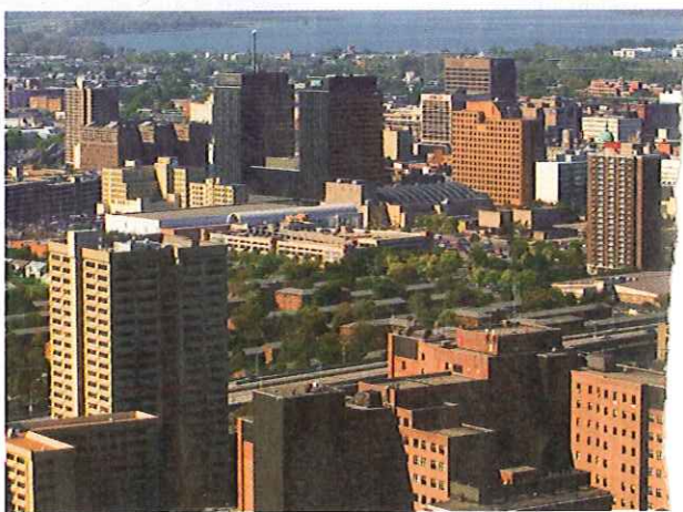
No snow today: The summertime skyline of Syracuse, N.Y.

Less than a mile east of the Oncenter and I-81, Genesee Street is the site of two more upscale properties: the 157-room Genesee Grande and 279-room Renaissance Syracuse.